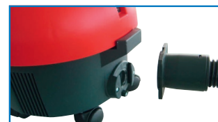
Robust plug-in suction hose