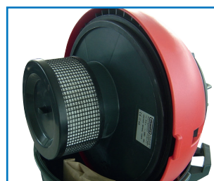
Motor head with hepa filter