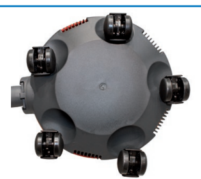
5 castors for stability and agility