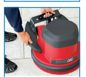
To transport, simply remove the standard weight