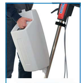
Easy mounting and demounting of the solution tank (optional)